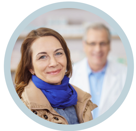
Actor portrayals unless otherwise noted.

Also called “secondary insurance,” this is extra insurance you can buy to help pay for services and out-of-pocket costs that your regular health insurance plan doesn’t cover, like copays, deductibles, and coinsurance, or dental or vision costs.