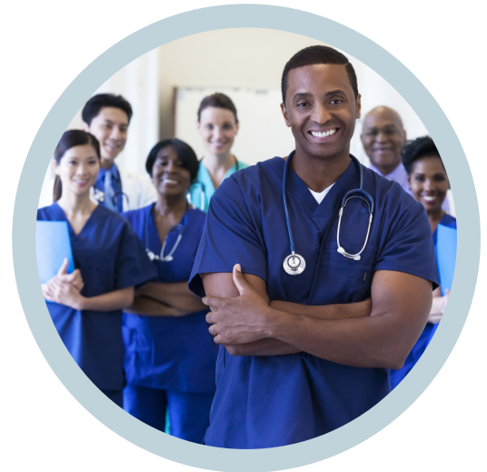
Actor portrayals unless otherwise noted.

This is the yearly period in the fall when you can enroll in a health insurance plan for the next calendar year.