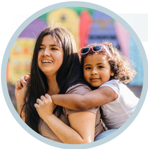
Actor portrayals unless otherwise noted.