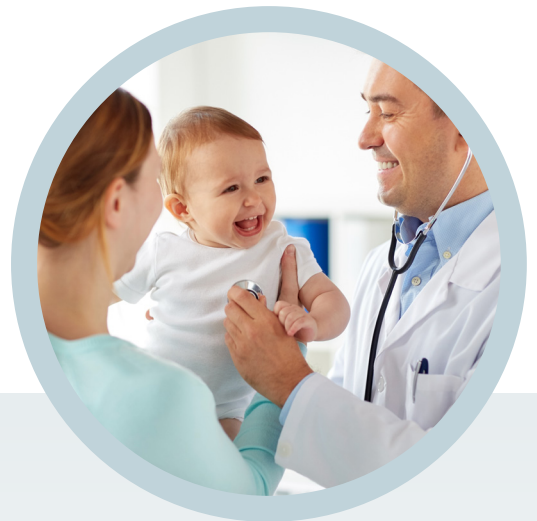
Actor portrayals unless otherwise noted.

Your premium is the amount you pay for your health insurance every month. In addition to your monthly premium, you usually pay other healthcare costs, like deductibles, copays, and coinsurance.